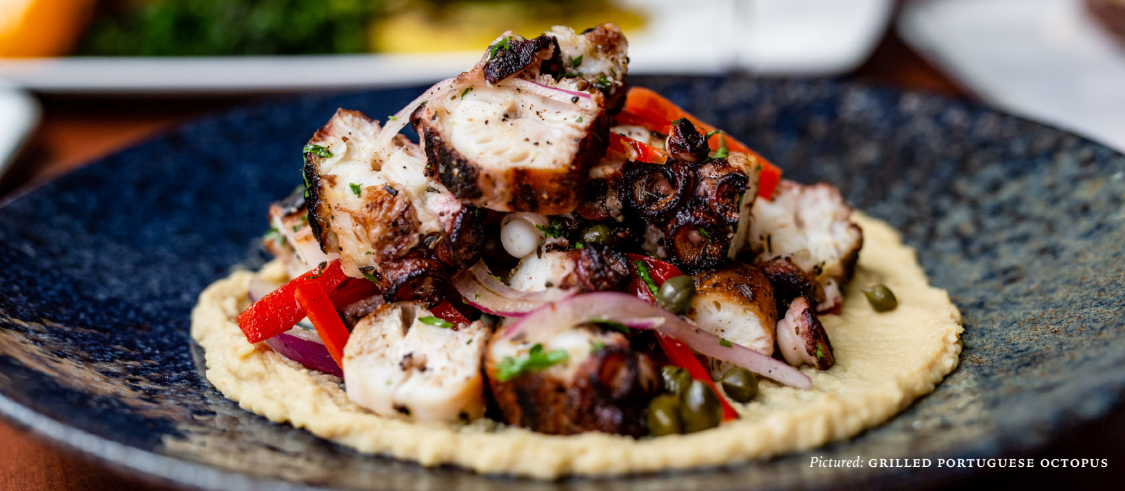
Pictured: GRILLED PORTUGUESE OCTOPUS