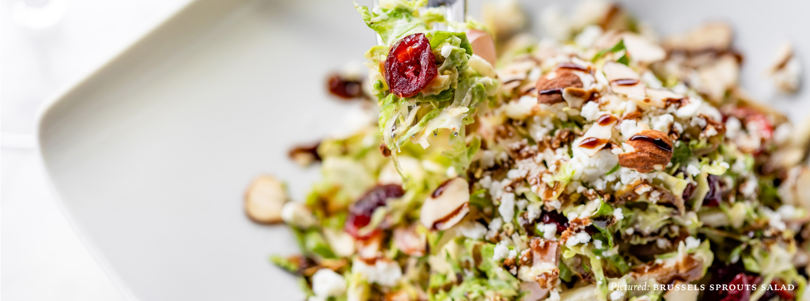
Pictured: BRUSSELS SPROUTS SALAD